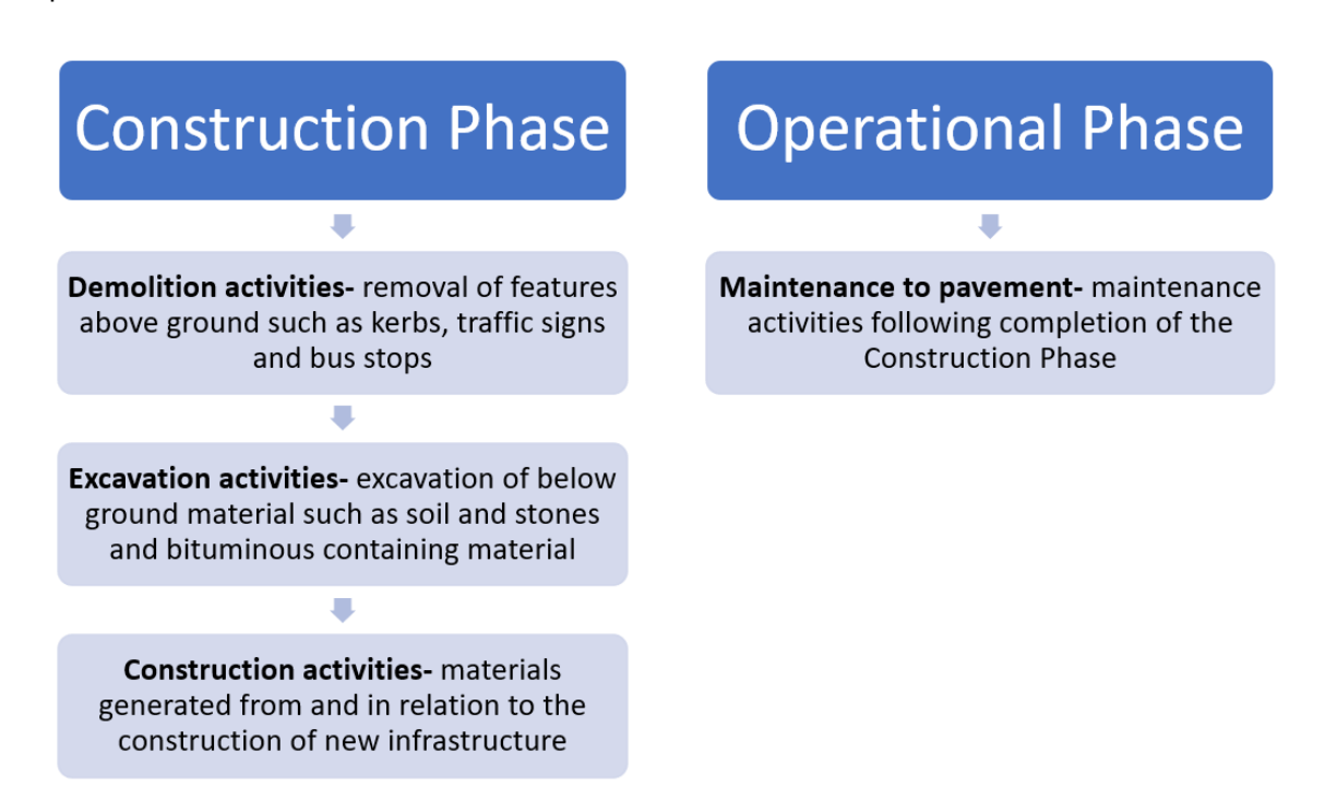
Image 18.3: Summary of Surplus Materials Source Considered in this Assessment for Each Phase of Proposed Scheme

A summary of both phases of the Proposed Scheme and the source of surplus materials considered in this assessment is set out in Image 18.3. For the purpose of the Proposed Scheme bituminous materials have been quantified and assessed under the excavation activities.